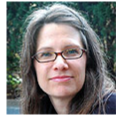
Coauthors (top to bottom)