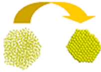
Figure 1: +enlarge

Nanoclusters are now becoming of widespread use in various applications, ranging from medicine (DNA-sequencing), to memory storage (nano-magnets), optics (quantum dots), and catalysis (fuel cells). Such a wide range of applications is possible because of the enormous variety of properties which are found in nanoparticles of different sizes and made of different materials. The properties of a nanoparticle are a consequence of its actual structure. Our paper constitutes a reference work for the structural properties of these objects.