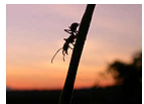
An ant of the genus Ectatomma... -> [i]