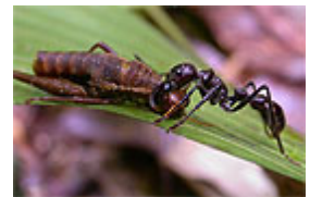
The bullet ant... -> [i]