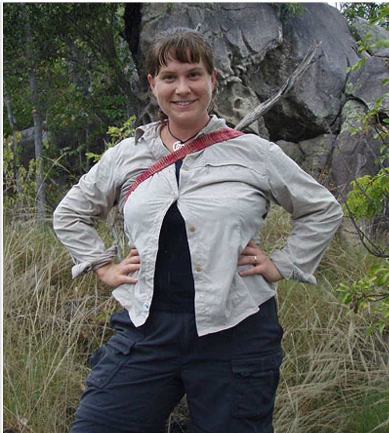
FIGURE 4 DESCRIPTION:

Dr. Corrie Moreau on Magnetic Island, Queensland, Australia.