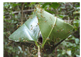
Green tree ants... -> [i]