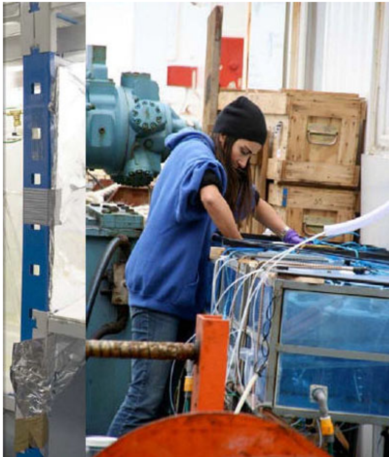
Figure 2: The next step after the laboratory incubations is to field test the results observed using cultures." Here, I'm setting up deck incubation experiments aboard RV Discovery in the summer of 2007.