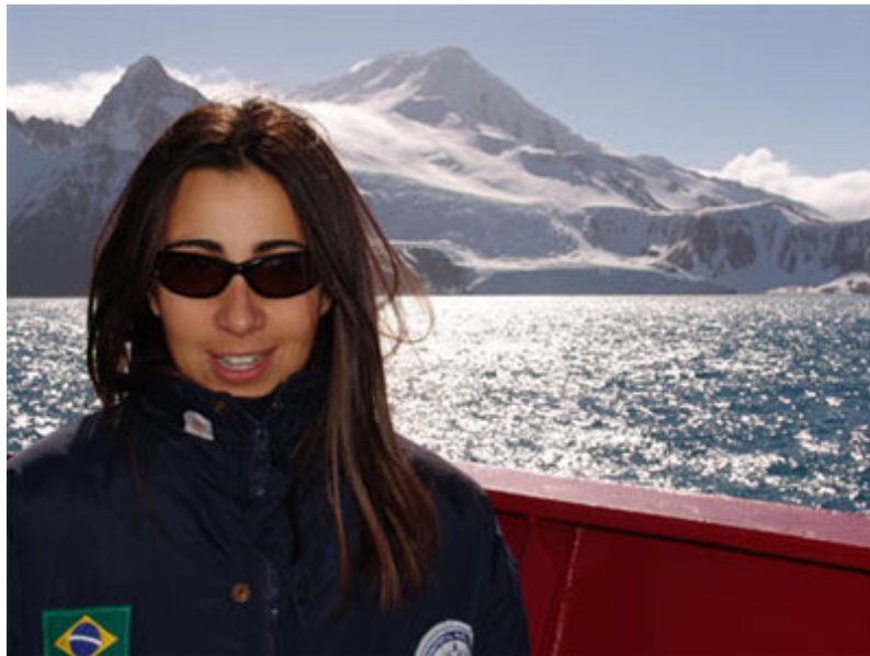
Figure 1: My work has taken me to the most remote locations in the world such as Elephant Island, in the South Atlantic.