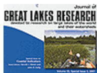
Figure 1: + details