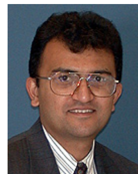
Coauthor: Mayuresh Kothare

Other approaches such as metal hydrides and carbon nanotube based H 2 storage have also been explored in the past, but without much improvement in actual storage capacity. Compared to this, liquid hydrocarbons such as methanol are pretty easy to store and handle, and for each cc of methanol that is