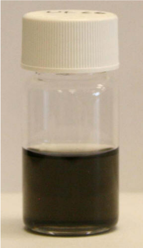
Fig 1. A photo of an aqueous suspension of hydrazine-reduced K + ion-modified graphene oxide (hKMG) platelets.