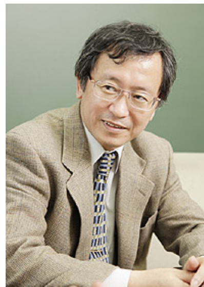
Professor Yoshinori Tokura is one of Japan's most distinguished condensed-matter physicists and a global leader in the cutting-edge field of correlated electron materials.

Today, he ranks among the 10 most-cited physicists of the last three decades, having published nearly 1,000 research articles which have been cited close to 45,000 times. His h-index is fast approaching 100, signifying authorship of 100 papers each cited 100 or more times. Professor Tokura's 10 most-cited papers are listed in Table 1 on the next page.