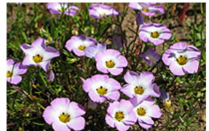
San Diego County is a recognized biodiversity hotspot with an incredibly diverse native flora. This diversity is under constant threat from habitat loss and fragmentation, particularly from intensive coastal development.