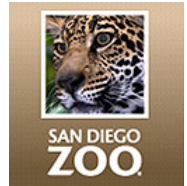
San Diego Zoo

Speaking of the coastal cactus wren, one of the other projects the Applied Plant Ecology Division is involved in is the preservation and restoration of coastal scrublands, the habitat for this particular species of wren. The wren lives in sage scrub that contains a high abundance of prickly pear cactus, and prefers to roost in cacti that are at least three feet tall. The San Diego Wild Animal Park's land is host to about 900 acres of coastal sage scrub natural habitat, but that habitat is in danger even at the Park, due to the increasing frequency of wildfires.