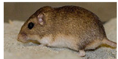
Kangaroo rats and pocket mice (pictured) are considered keystone species that influence ecosystem processes in desert, shrub, and grassland ecosystems.