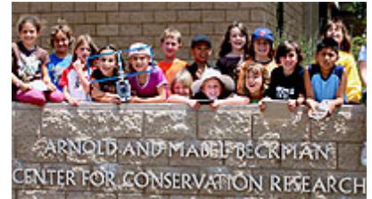
The Arnold and Mabel Beckman Center for Conservation Research

Copyright | Terms of Use | Privacy Policy