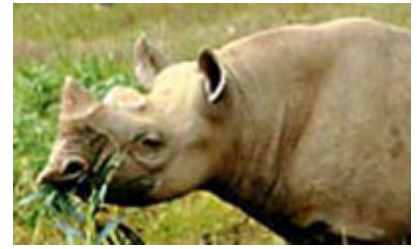
Black rhinos (pictured) and white rhinos are the same color—they're both brownish gray!

"One of the main factors that was causing problems was fighting, particularly by males directed at other males, or even at females and young," Swaisgood explains. "We found, for example, that you need a larger reserve to accommodate this kind of social conflict. They need to be at lower social densities in the post-release environment than in the environment from which they came. Rhinos living in a stable environment, even though they are solitary and aggressive animals, know their neighbors and develop relationships with them that prevent escalated fights. Throw a bunch of them together in a new area where they start encountering each other, they fight, they panic, they're under a lot of stress, and they take off running—they don't stay where they need to stay for their own self-interest. They run through the established boundary fences that were built—crash right through them. One rhino crashed through a fence and ran into an ecotourism lodge, fell into the swimming pool, and drowned."