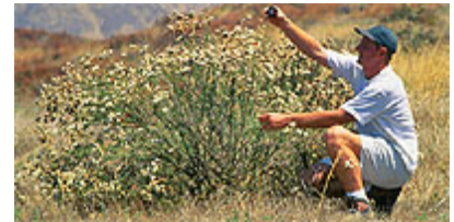
Of the 1,800 acres that comprise the Wild Animal Park, 900 are undeveloped, consisting largely of pristine coastal sage scrub.

And in a translocation there are many competing needs: they have to find a new place to settle, to be on the lookout for predators, and if you add one more cost to them—that of forcing them to develop new relationships with new neighbors—you might actually hinder that effort. And we found that that was the