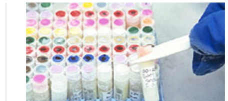
The Frozen Zoo®