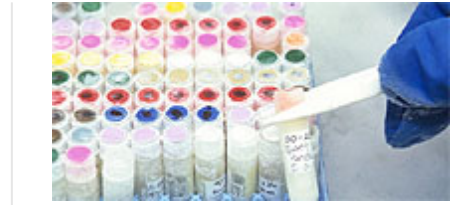
The Frozen Zoo®